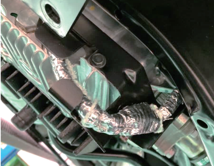
Fig.2 Diff Oil Temp Sensor Harness with Heat Insulation